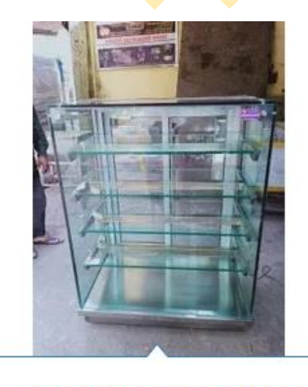
Display Counter Tops