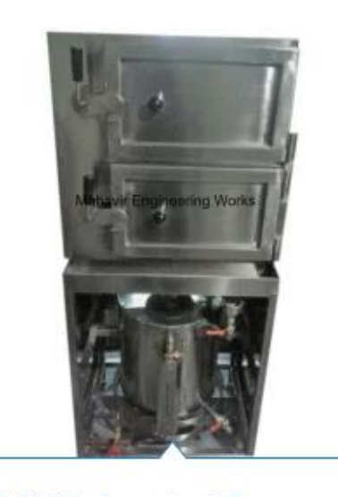
Table Top Electric Deep Fryer Table Top SS Electric & Gas Deep Fryer Double Basket Electric Deep Fryer