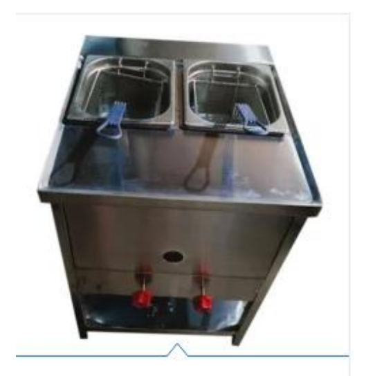
Gas Deep Fryer

Floor Mounted Gas SS Deep Fryer Floor Mounted Gas Deep Fryer