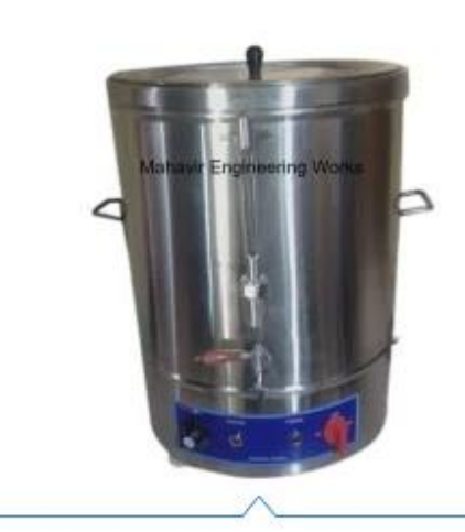
Milk Boiler Machine